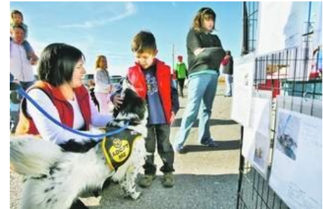
Purchase this Photo